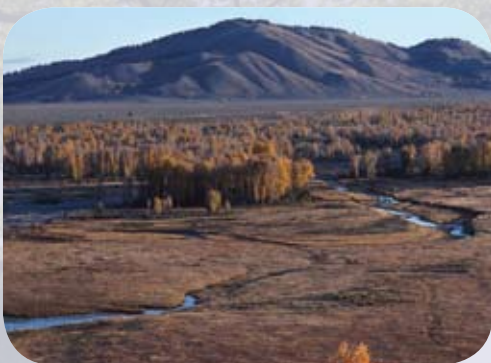
A stream flows through rangeland in Wyoming.