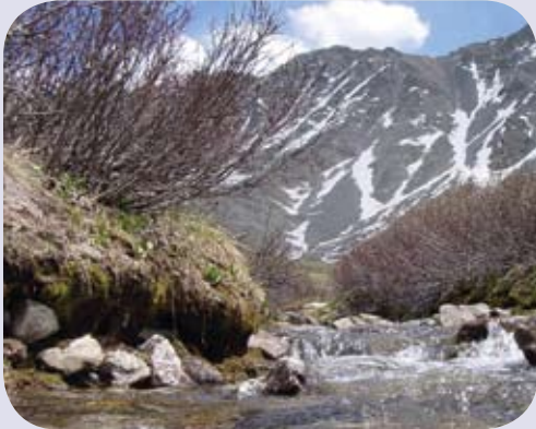
Trees, Water & People are helping to protect rivers like this.